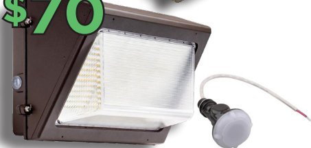
KT-WPLED80-M1-8CSB-VDIM-MW3 Photocell that can be turned on & off