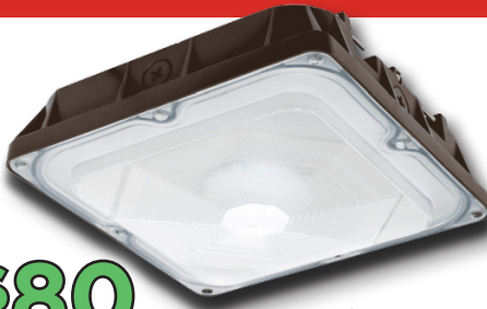
Vapor Tight 120-277V