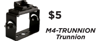
$5 M4-TRUNNION Trunnion