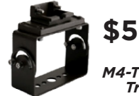
M4-SLIP-FITTER Slip Fitter