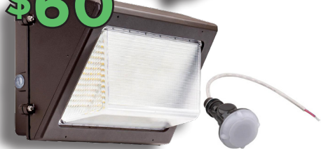
KT-WPLED80-M1-8CSB-VDIM Photocell that can be turned on & off