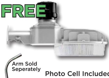
Arm Sold Separately Photo Cell Included