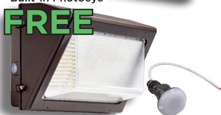
KT-WPLED80-M1-8CSB-VDIM Photocell that can be turned on & off