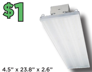
4.5" x 23.8" x 2.6" Chain & Surface MTG Hardware Incl.